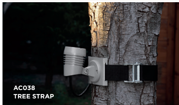
AC038 TREE STRAP